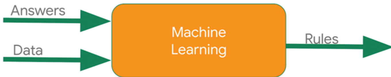
(Traditional Programming vs. ML Model Diagram)

The model is used at runtime by passing data through it, allowing the model to make predictions based on the rules it inferred during training.